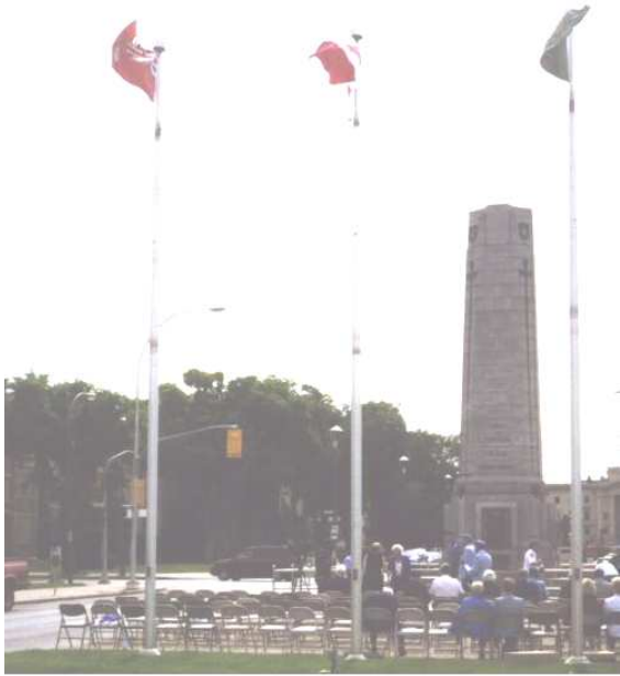
Winnipeg cenotaph, August 2002. The HK Veteran's flag flies here in August and December. We will remember them.