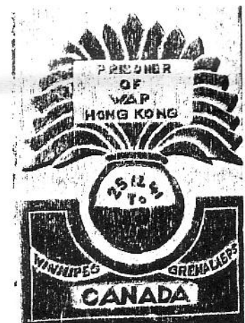
"Prisoner of War Hong Kong 25 12 41". This information is being sought by the